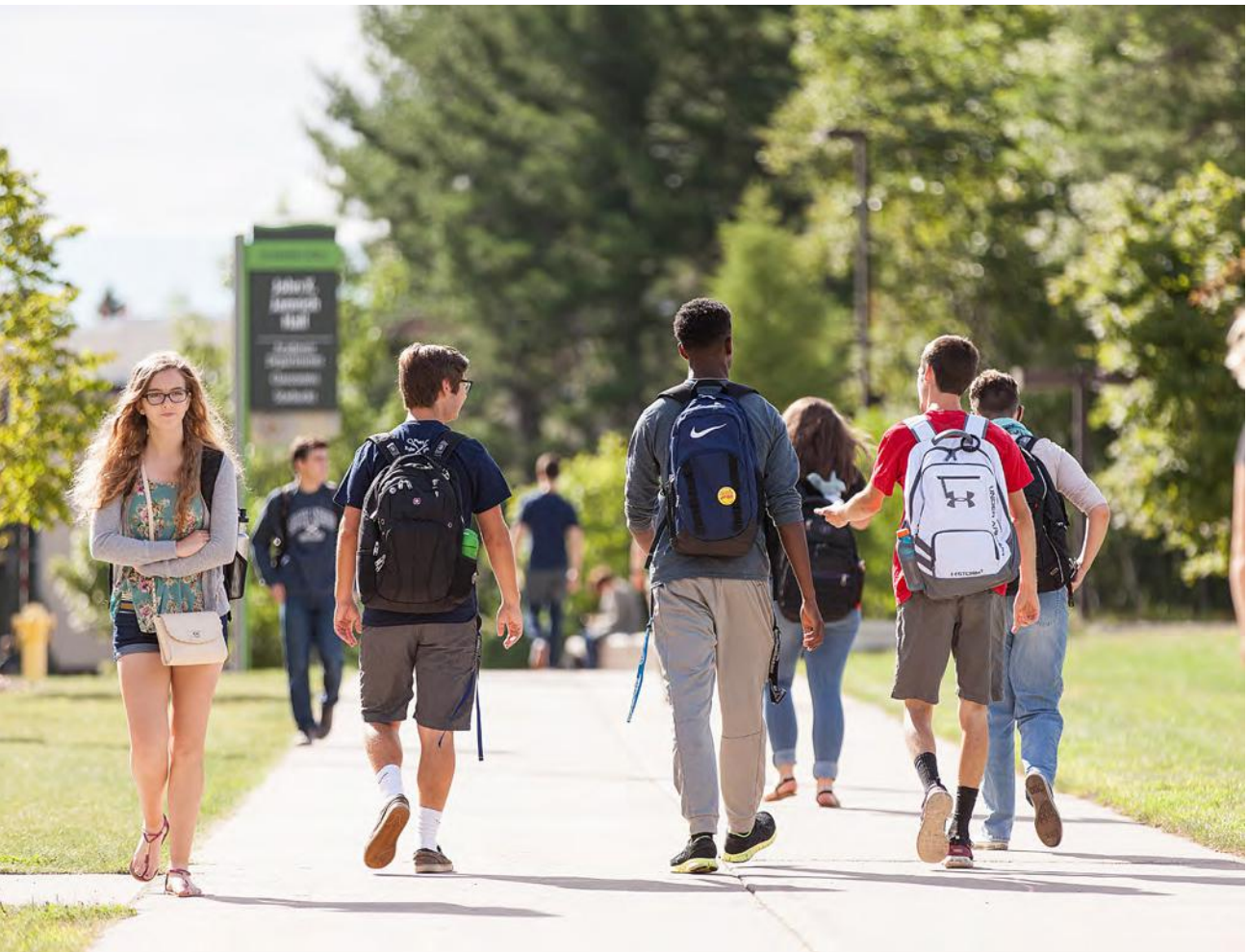
Clockwise: Willy and Al Ro- ker parading in before the (successful!) attempt by 634 NMU students to break the record for the world's largest game of freeze tag; A student working on a medicinal plant lab; Hands-on learning in the Art & Design lighting studio; Students walking to class on a beautiful day